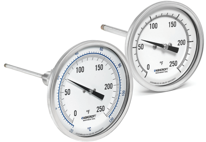
CI Bimetal 2", 3", 5" dial sizes