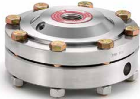
740-41 High Displacement Threaded Seal