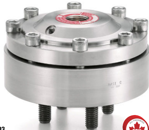
702-703 Flanged Seal