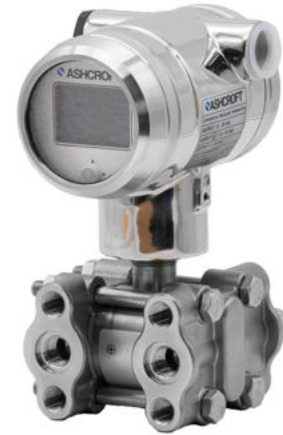
Differential Platinum Series DP55