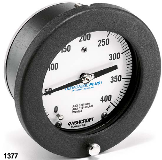
1377 4 ½" dial size